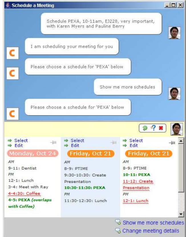
Figure 2: PTIME Collaborative Interface

We thank all the members of the CALO project, especially our collaborators at SRI, University of Michigan, and USC. This material is based upon work supported by the Defense Advanced Research