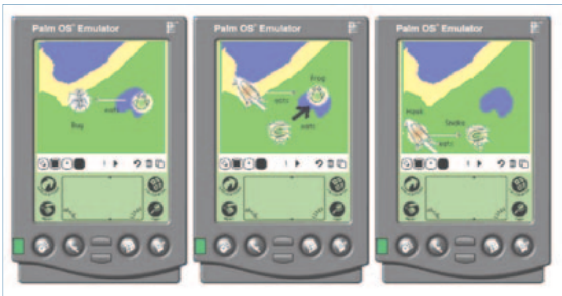
Figure 3. A Sketchy animation of the food cycle near a pond. Student animations demonstrate their understanding of relationships among animals in the environment.

Slot Machine's social structure is also quite different. In this application, one student solves a problem and another student "grades" the work. The students are rewarded with extra points if they both do well.