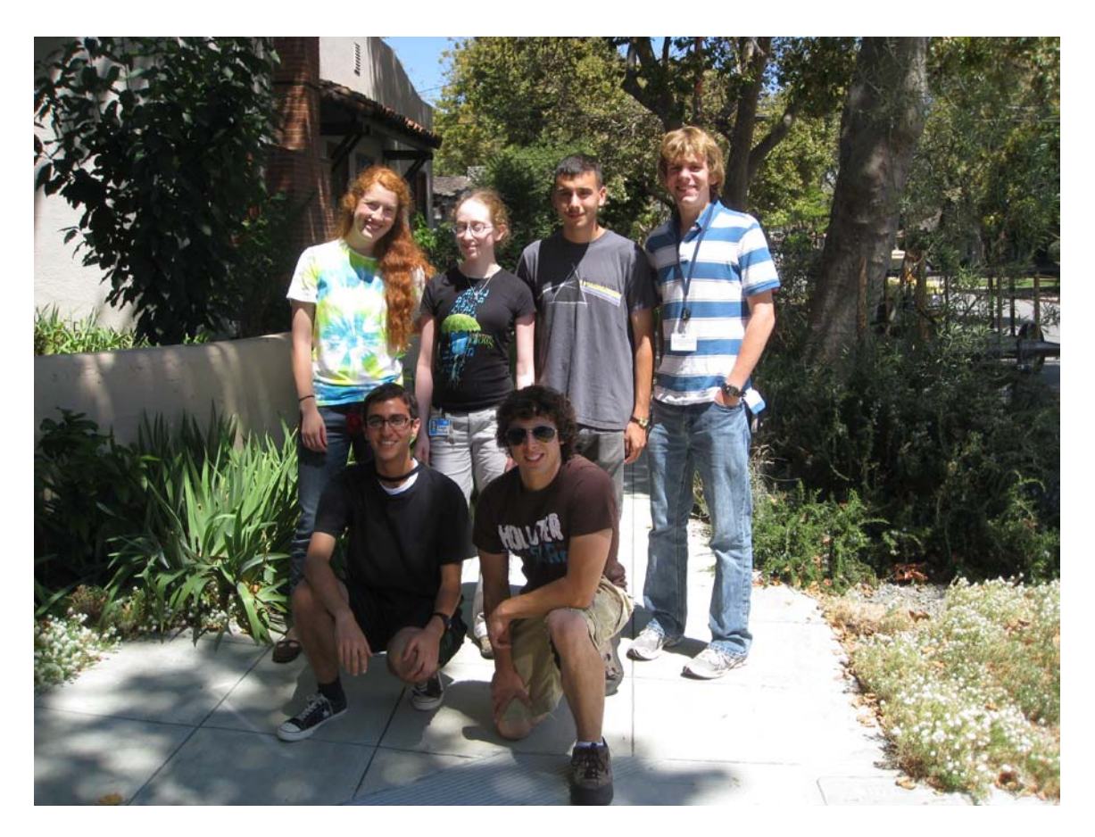
REU 2010 Students