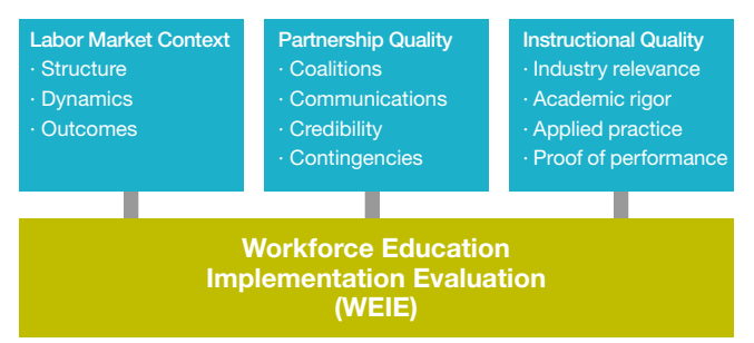
Figure 2. Framework for workforce education implementation evaluation