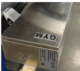
Before applying Self-Cooling Paint