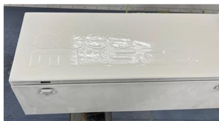
After applying Self-Cooling Paint