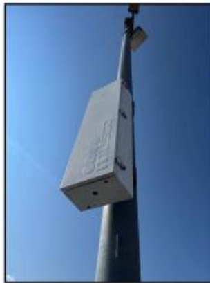
Self-Cooling Paint coated enclosure, mounted.