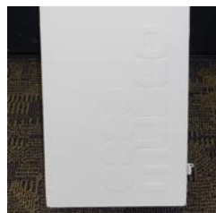
Final finish of Self-Cooling Paint after 48 hours