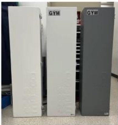
Three enclosures for comparison: Self-Cooling Paint (L) Powder coated standard white paint (C) Powder coated gray paint (R).

3. In the subsequent week, the effect of the internal thermal load was observed on the internal temperature and temperature of electronic boxes, mounted inside the enclosures. The plot above (right) for a single day data represents typical behavior. During solar peak hours, no light is expected from MUSCO's system. Hence the test with power off demonstrates the temperature of two electronic boxes during peak solar hours. When lights were on, the electronic boxes generated internal heat. To our surprise, electronic boxes in SRI's painted enclosures were at a lower temperature than the gray and bright white painted enclosures – which were almost at the same temperatures. The maximum temperature differential of 5°C was observed.